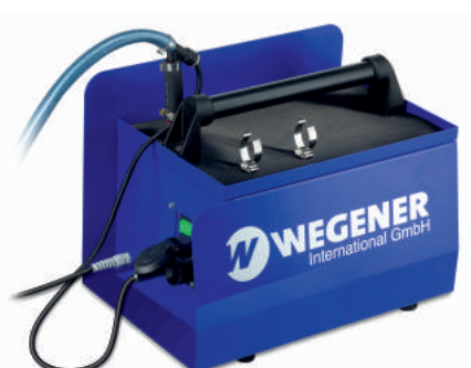
WEG AB 60 Item no. 24528