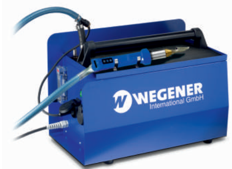
WEG AB 120L Item no. 24530