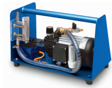
DT 6L Item no. 10826

Our blowers reliably supply hot gas welders with filtered and constant air volume. All our blowers are characterized by their low weight and exceptionally low running noise.