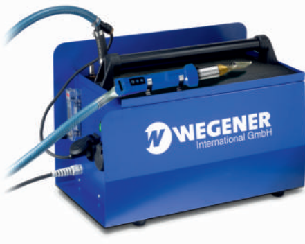
Picture Basic kit Autotherm4 WEG AB 120L