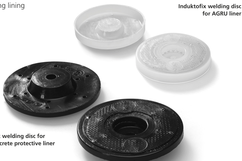
Induktofix welding disc for AGRU concrete protective liner