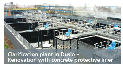
Clarification plant in Duslo – Renovation with concrete protective liner