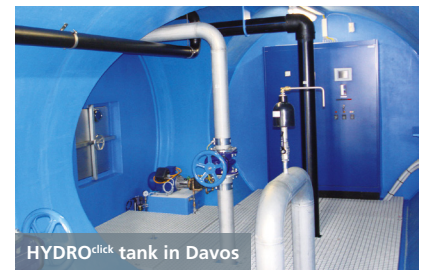
HYDRO click tank in Davos

The HYDRO CLICK system provides a fast and safe installation for new constructions as well as renovations (e.g. water storage tanks).